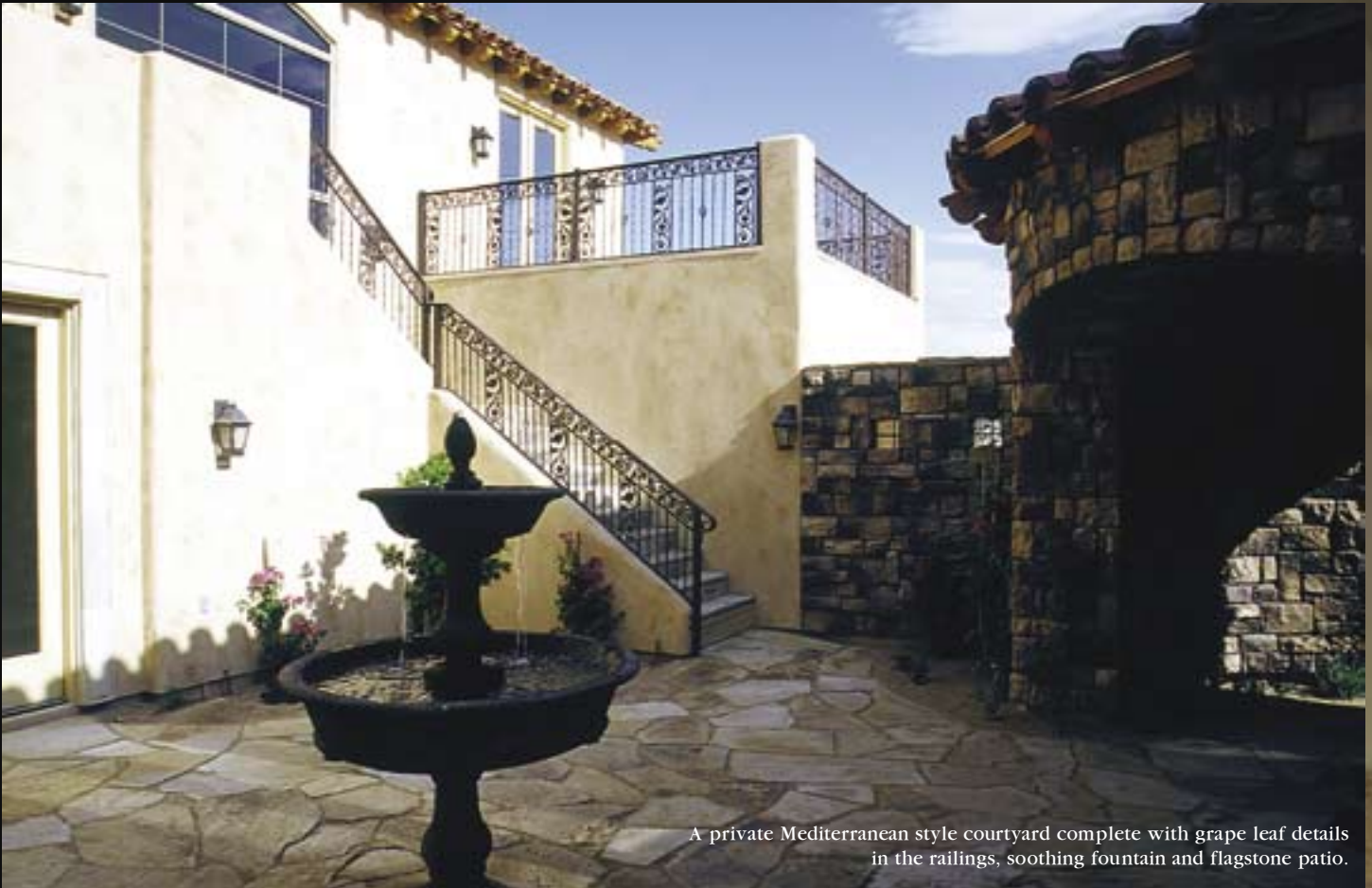
A private Mediterranean style courtyard complete with grape leaf details in the railings, soothing fountain and flagstone patio.