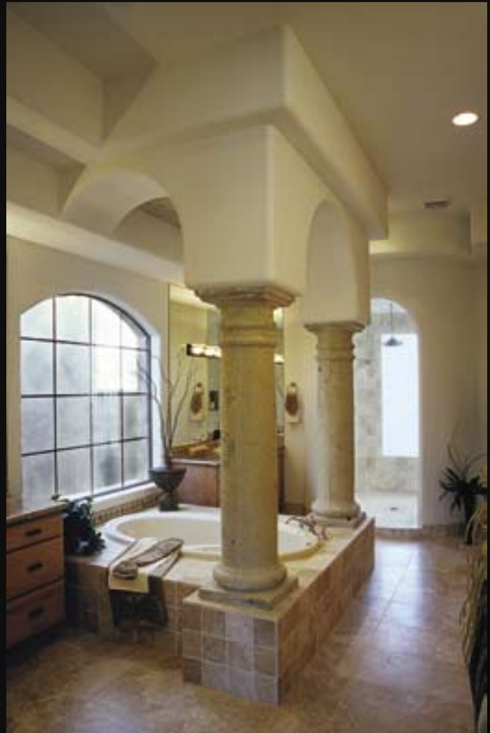
This elegant Tuscan style bath features separate vanities of Travertine slab, cantera stone columns, spa tub, a massive walk in shower with a rain head and 2 separate shower heads.