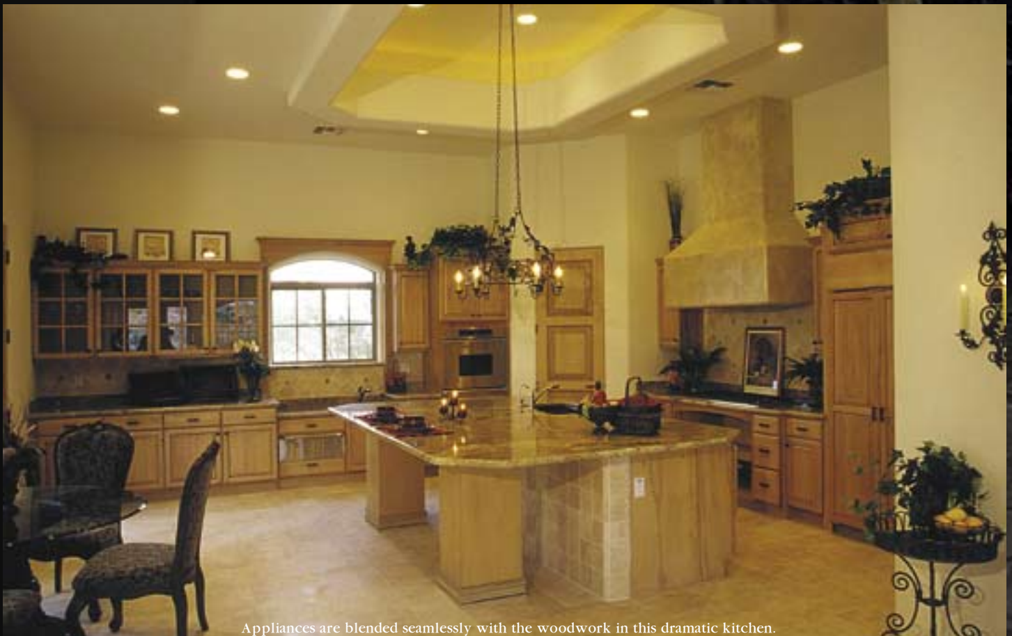
Appliances are blended seamlessly with the woodwork in this dramatic kitchen.

Perfect harmony is ever the goal at Regency, and compromise is never an option. The discerning homebuyer's desire for dramatic views from private custom home sites nestled in the majestic Arizona landscape incorporates environmentally sensitive grading to preserve the integrity of the land and native vegetation. The site dictates the location and size of windows, views, convenience and much more. Every home Regency builds is designed for best use of the site.